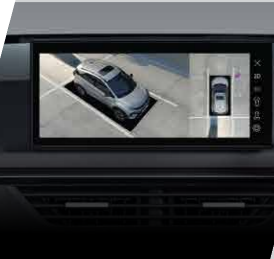
360° HIGH DEFINITION SURROUND VIEW SYSTEM WITH A BLIND VIEW MONITOR