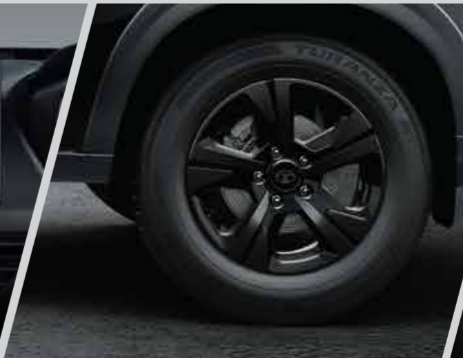
R16 ALLOY WHEELS