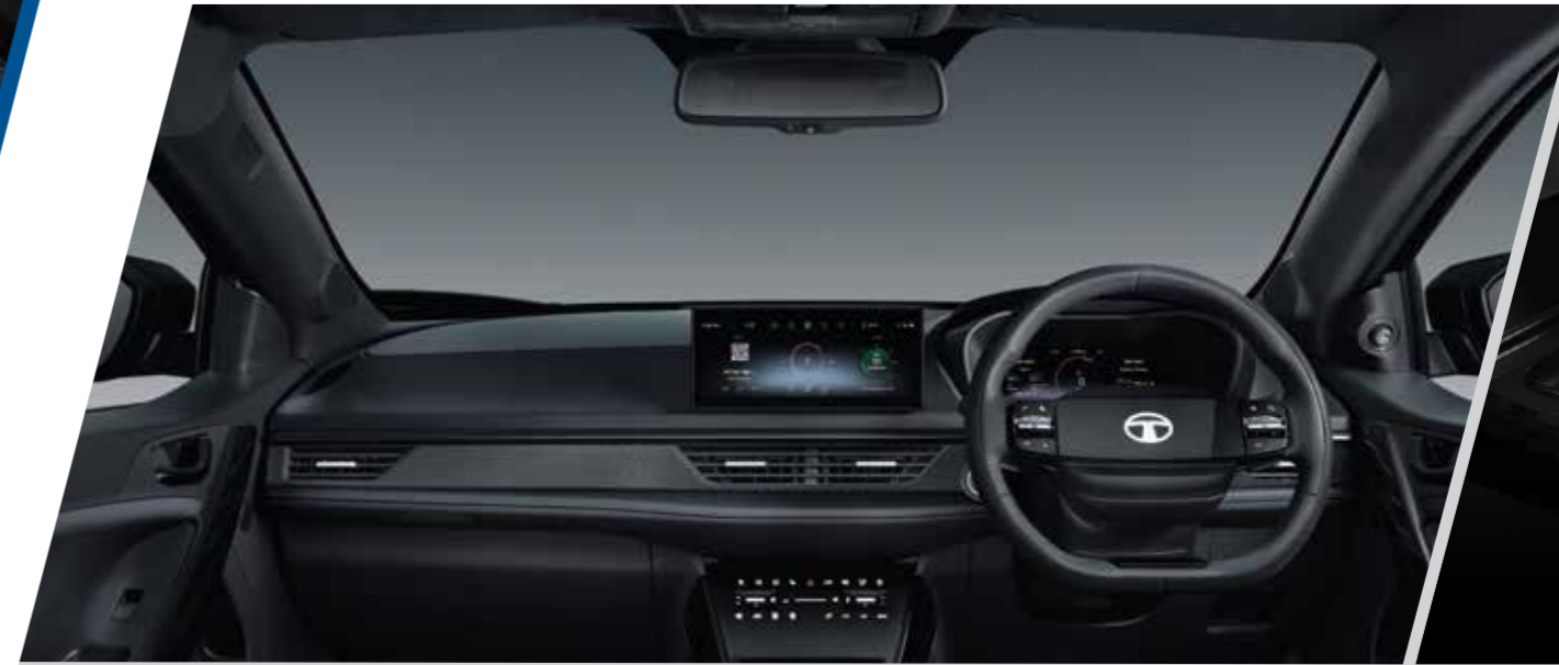
#DARK THEMED DASHBOARD